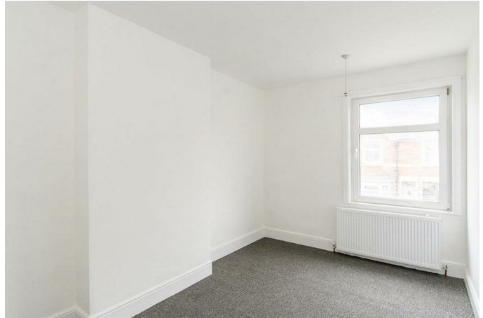
Bedroom One 13'5 x 10'7 (4.09m x 3.23m)

UPVC double glazed window to rear aspect. Radiator.