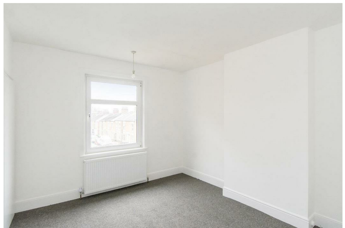
Bedroom Two 13'8 x 10'4 (4.17m x 3.15m)

UPVC double glazed window to front aspect. TV point. Radiator.