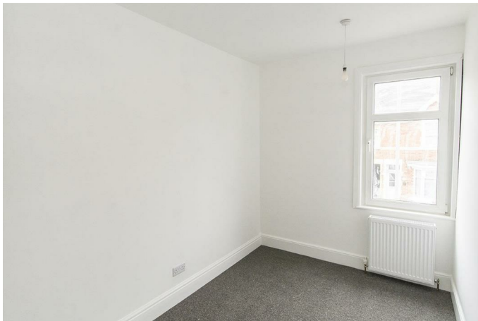
Bedroom Three 13'8 x 6'2 (4.17m x 1.88m)

UPVC double glazed window to front aspect. Loft hatch access. Radiator.