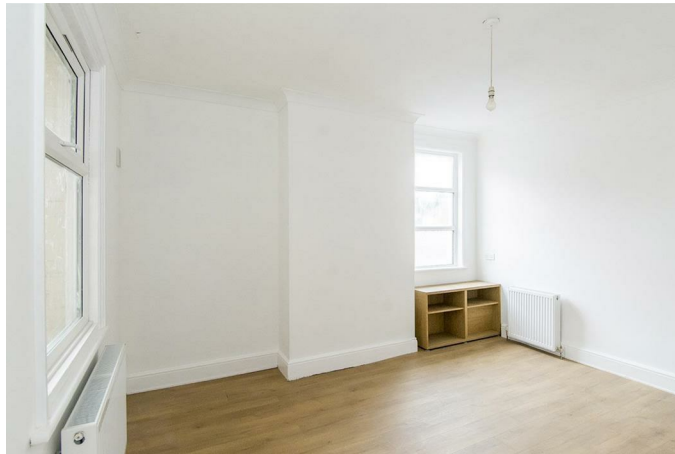
Dining Room 13'4 x 13'4 (4.06m x 4.06m )

UPVC double glazed window to rear and side aspect. 2 x radiators. Wood laminate flooring. Opening through to: Kitchen.