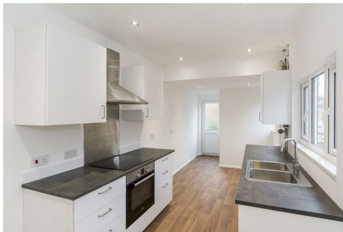
Kitchen 20'0 x 8'0 (6.10m x 2.44m)

Refitted kitchen/breakfast room with a range of fitted base and wall units. Laminated work tops. Fitted oven and four ring electric hob with stainless steel extractor hood over. Stainless steel double sink. Door to walk in under stairs storage cupboard. Wood laminate flooring. Space and plumbing for automatic washing machine. Two double glazed windows to the side elevation. Wall mounted, brand new, gas fired boiler. Opaque double glazed door leading outside. Door to:-