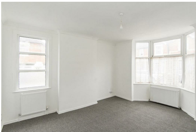
Lounge 13'6 x 13'4 (4.11m x 4.06m)

UPVC double glazed bay window to front aspect. UPVC double glazed window to side aspect. TV and telephone point. 2 x radiators.